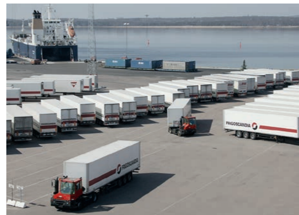
Transport and logistics