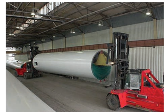
Other heavy industry

How can we make sure your business never stops?